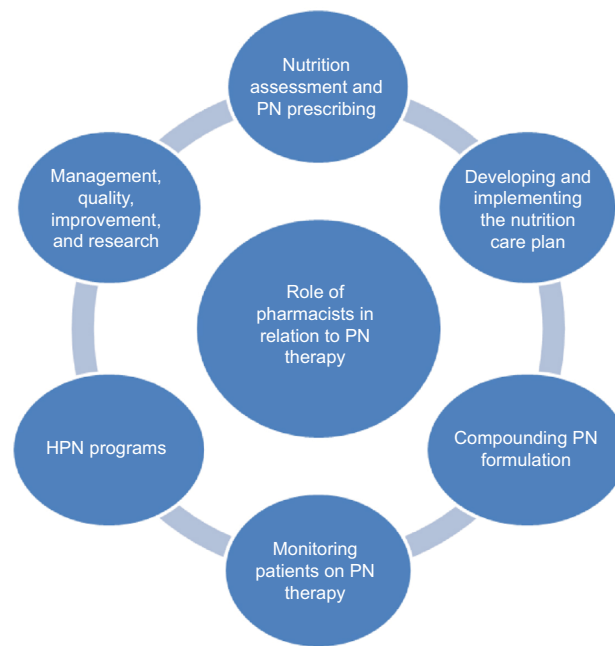
Figure 2 Pharmacists' different roles in relation to PN therapy. Abbreviations: HPN, home parenteral nutrition; PN, parenteral nutrition.

summarizes the key findings of the relevant studies that were included in this review.